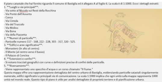
Figure 2: Example of metadata extraction from maps